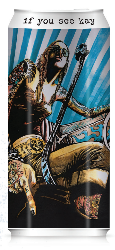
RED BLEND • 375ml 14.5% Alc. by Vol.