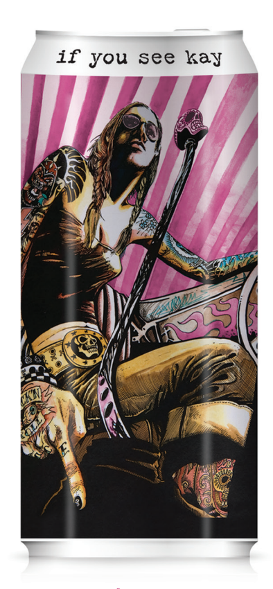
ROSÉ • 375ml 13.0% Alc. by Vol.