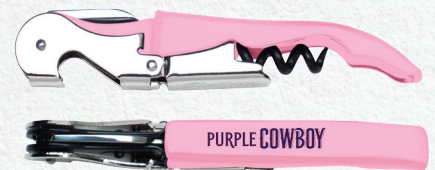
BRANDED WINE OPENERS