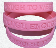
TOUGH ENOUGH TO WEAR PINK™ WRISTBANDS